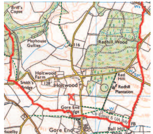
X marks the site of Rickety Gate Farm, where Rachel Paul's dog-breeding operation is planned

The report concludes with a schedule of 15 broad conditions, mostly relating to building materials and standards, lighting, landscaping, parking and turning provision, drainage, a reptile survey and the log-cabin, for which temporary residence is now granted.