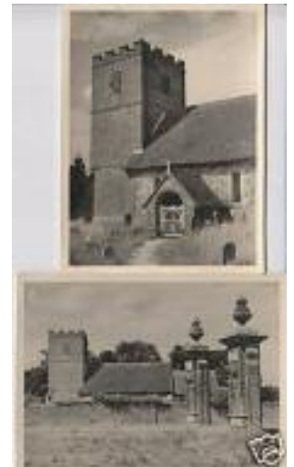
St Mary's photographed circa 1952