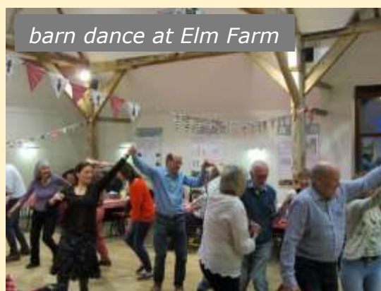
barn dance at Elm Farm

2019 White Hart reopens as pub and restaurant with microbrewery. Saviour Pennies beer club is launched. Elm Farm is put up for sale in eight lots. Village hall is granted local listing.