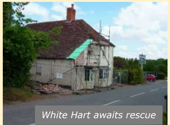
White Hart awaits rescue

2010 Lawrence Woodward leaves ORC/Elm Farm, to be replaced by Nic Lampkin. White Hart closes and comes up for sale. Prince Charles visits ORC at Elm Farm. Food festival at Elm Farm and parish party in village hall field.