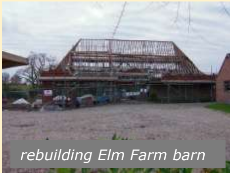
rebuilding Elm Farm barn

2007 First village bonfire night fireworks party. Sovereign sells the former garages site. Row over who gets to live in the Grove. 49 out of 74 village households want broadband. EFRC becomes ORC, and contests parish council objection to lifting the tie on cottages. First parish plan adopted.