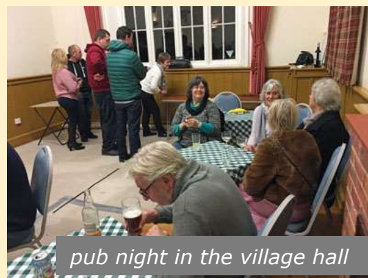
pub night in the village hall