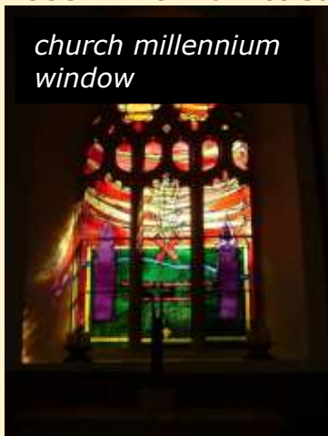
church millennium window