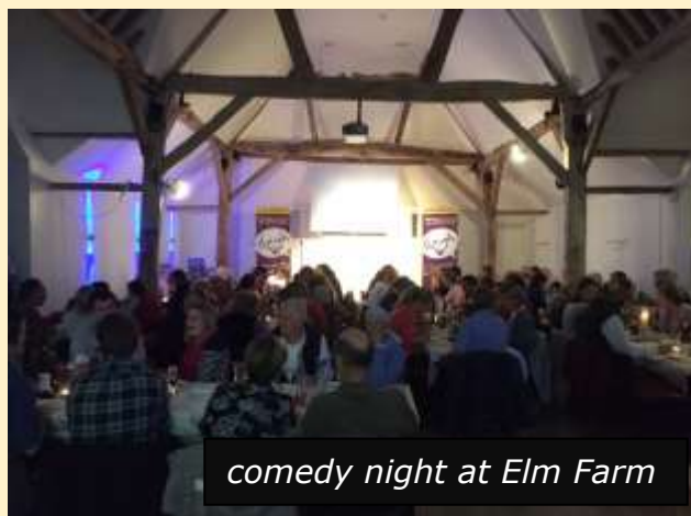
comedy night at Elm Farm

2015 Summer jazz evening at Park Lodge and a comedy night at Elm Farm raise funds for the church. The White Hart closes, and applies for change of use. Campaign to oppose White Hart redevelopment is launched. 4G reaches Hamstead.