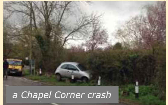
a Chapel Corner crash

2008 Record nine car crashes at Chapel Corner. Vodafone 3G broadband reaches parts of Hamstead. Elm Farm's listed barn is rebuilt, followed by major conversion of farmyard buildings.