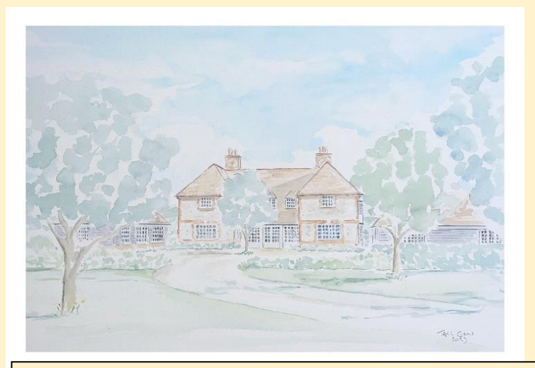
The house which will be built on the site of modern barns.

One month earlier, WBC approved the plan to build a new house on the site of redundant farm buildings at Elm Farm, which for centuries had been the chief farm in the village before being taken over around 1980 by the Organic Research Centre, which broke up the farm and sold it off in 2019. The new owners converted the former farmyard and organic research laboratory into residential accommodation, in addition to modernising the farmhouse separately for rental.